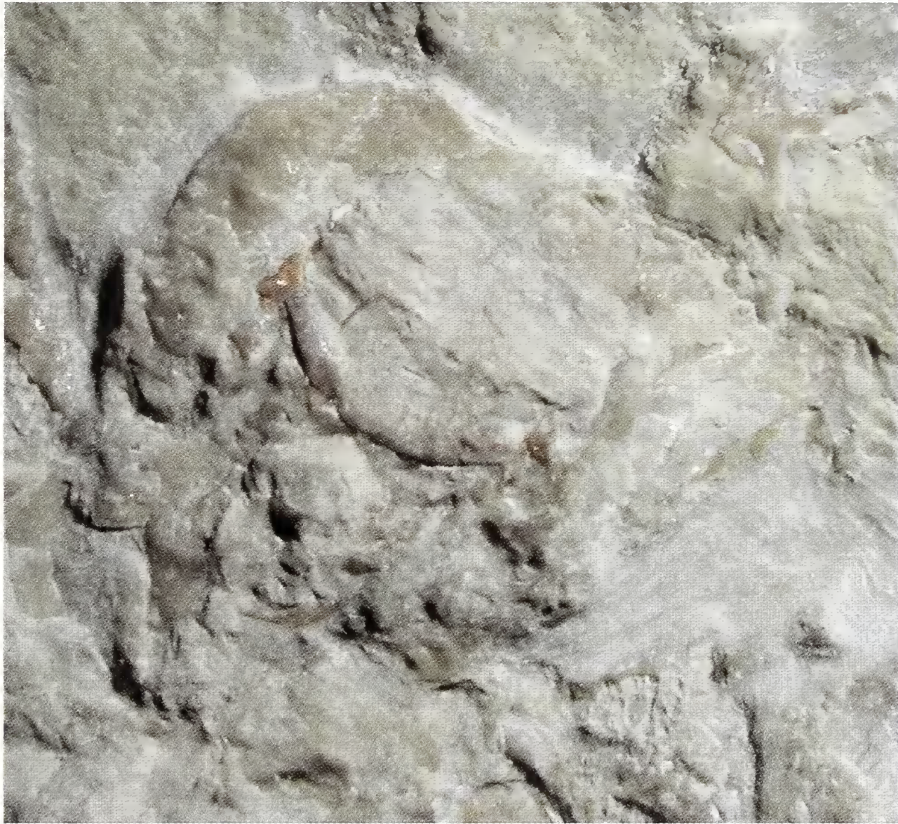
Fig. 5 – Striadiogenes frigerioi n. gen., n. sp., detail of cephalic shield / dettaglio dello scudo cefalico (x 8.3).